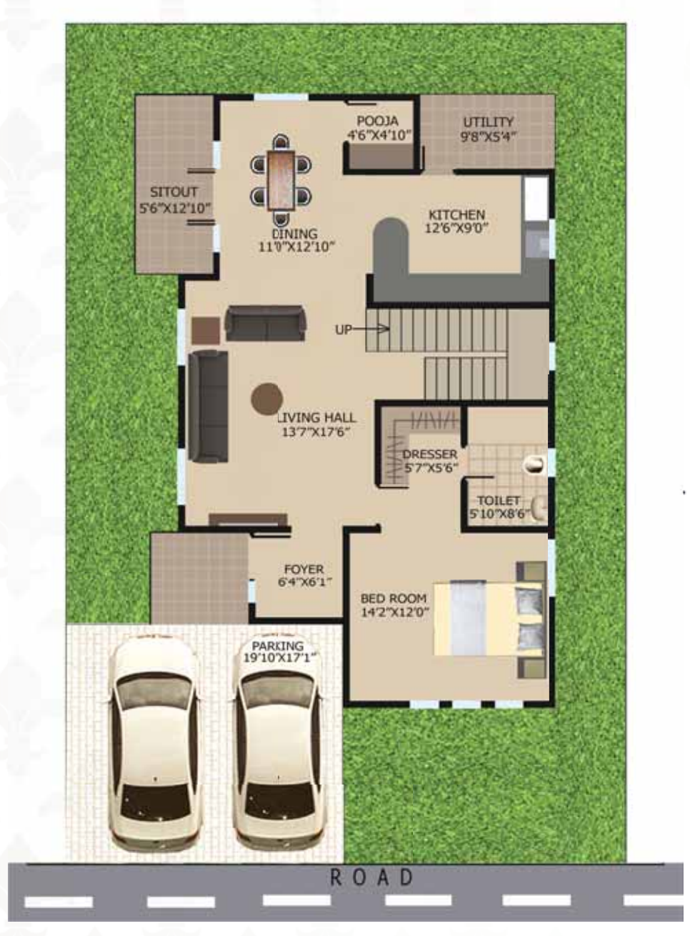
West Facing 40 x 60 Ground Floor